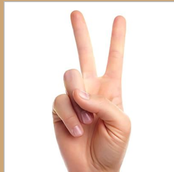
2 Minutes Left