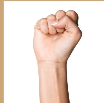
0 Seconds Left