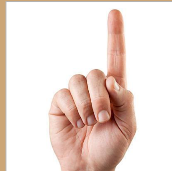
1 Minute Left