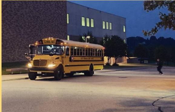
On the bus by 6:45 AM