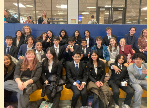
Countdown to Awards