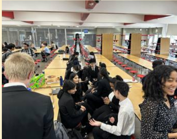
Waiting in between rounds